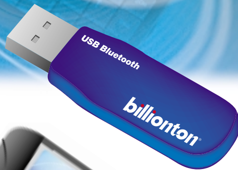
Bluetooth USB Adapter

Billionton-the last word in mobile connectivity