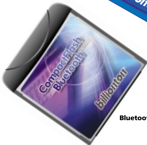
Bluetooth CF Adapter